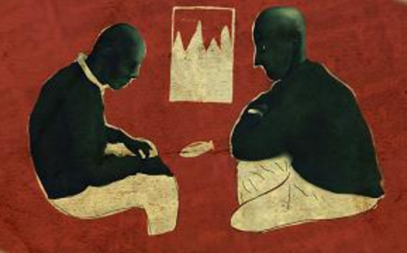
And are women beautiful?Really beautiful.