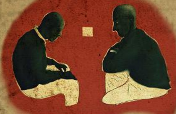
What will you do then? I will run to the other side There is no time. I will for days. Don't go out. I will look you from far.