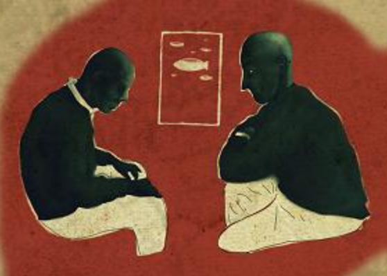
If they will find you out, they will kill you. I'll be already beyond the border, as an hero.