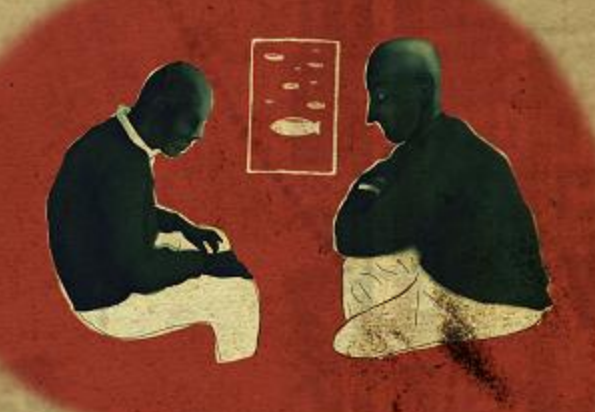
But... is it really different beyond the border? Sure! It's for this reason that they are bombing us!