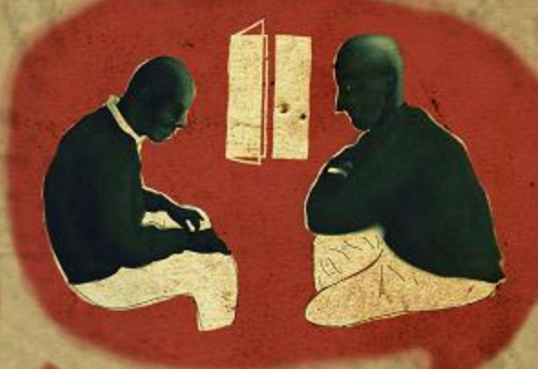
- I'm tired. You too. - So you can remain here thinking of...