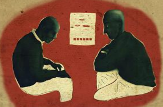
And you will remain lonely, in an hostile land. You will remain here, scared and without future