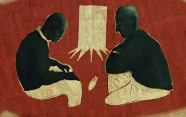
And we will be heroes. Heroes