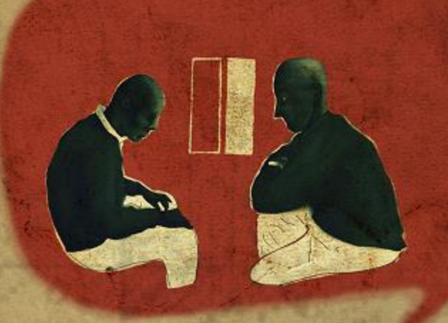
I'm here writing "Chronicles from the town of poised bombs". - A best seller.