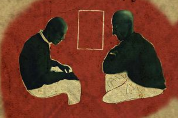
That was clear I will climb on the highest building and give a push to one of these bombs