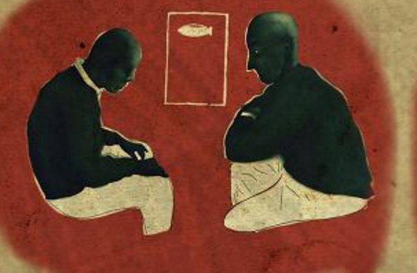
Good, and if it falls, there is your family below. They will die any way. As we'll do.