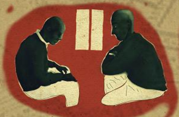
I don't feel good too, here inside. I told you. Tonight.