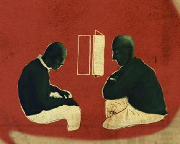
Our salvation. Yes, keeps on joking. And I will go out...