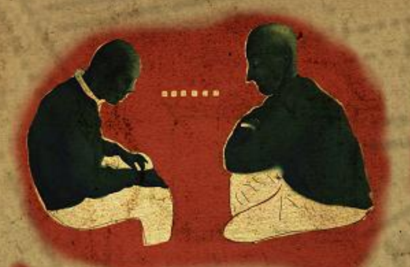
- ...and then? - Then what?