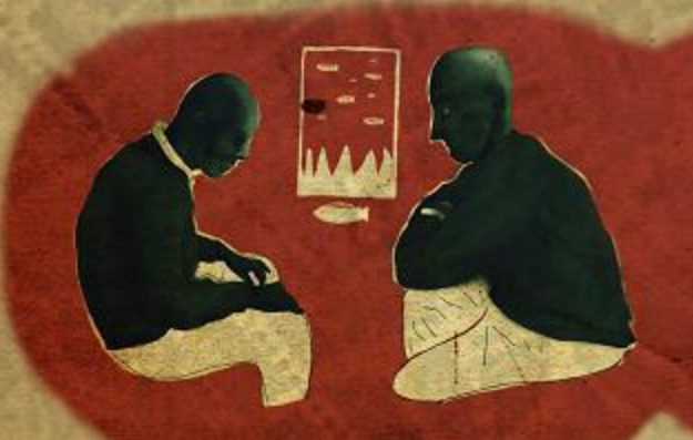
- But are they reliable? They will make you a hero... - Very reliable... Sure.