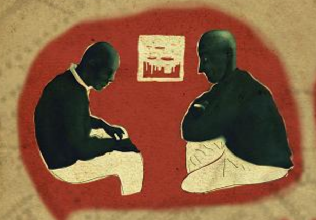
Yes, very good... And I'll be watching the bombs falling, killing you all.